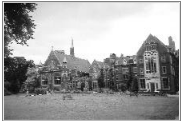
QUEEN'S HALL • CAMBRIDGE UNIVERSITY

The Conference was held at Homerton College, one of the many colleges at Cambridge University. The private accommodations were most comfortable, which along with the lecture/meeting rooms, made for excellent facilities. Both these buildings were recent additions to the College. Our meals, including the Conference Banquet, beautifully served, were in a dining hall typical of a Cambridge University dining hall – Queen's Hall .