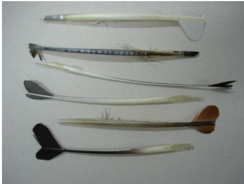
Figure: Cured and cut quills, domestic turkey, wild turkey, domestic Toulouse goose, domestic grey goose, peacock, and Canada goose quills.

imported into England during the eighteenth and nineteenth centuries from various countries including Ireland, Greenland, Iceland, Hudson Bay, Norway, Russia, Poland and Germany. They were sorted according to the length and size of the barrels into primes, seconds, and pinions, the best swan and goose quills coming from countries with